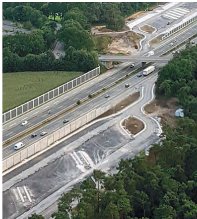
Image on the left: delivery of the sub-base material; right: Sürenheide motorway rest area after completion

In order to offer the customer the greatest possible assurance, the proposed solution was confirmed by an independent expert report. This gave the project managers maximum planning security with regard to the selected geosynthetic system.